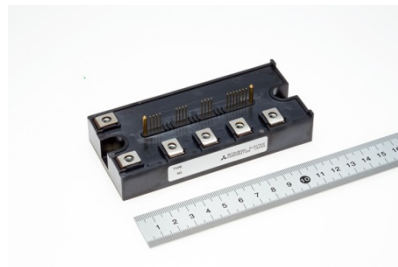
IPM G1series B Package