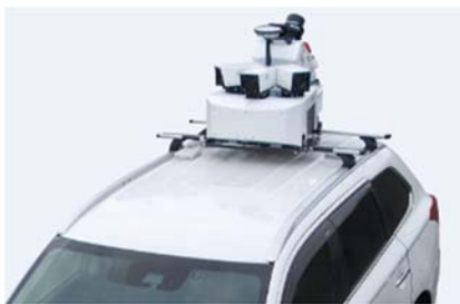
MMS-G is designed for diverse installations

The new MMS-G will be showcased at the Mitsubishi Electric stand, No. 12.1E.080 in hall 12.1 during INTERGEO at Messe Frankfurt exhibition complex in Frankfurt, Germany from October 16 to 18, 2018.